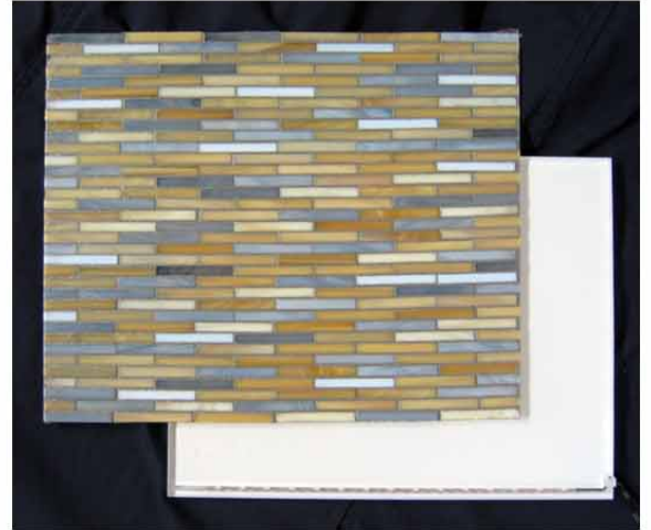
LED light sheet with grouted stained glass mosaic panel.

Power supply: Input 100-240 VAC / Output 12/24vdc