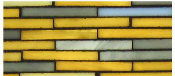
Detail of illuminated glass panel.